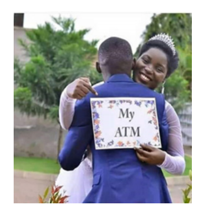
Meme 1 Meme 2

Facebook and WhatsApp memes portray women in many ways. Among them is that women are lovers of money. The constructions of women as 'lovers of money' discourse occurred across a variety of meme types. It was the largest category with thirty-one memes. This image of a woman is captured in the following: meme 1 reads, 'My ATM.' ATM is an abbreviation for Automated Teller Machine. An ATM allows for convenient banking. Customers are able to use Automated Teller Machines to withdraw money from their nearest machine at any time using personalised cards. The man in the picture is being referred to as the ATM. Interestingly, the picture appears to have been taken on a wedding day. This implies that the wife does not see a 'husband' in the man on the first day of their marriage. Instead, she sees an ATM in him, setting the tone for her motivation to get married to him. The picture seems to show how rocky or turbulent the marriage will be when the husband has no money. It also seems to suggest that the growth of their love in marriage will depend on the steady supply of money in the house.