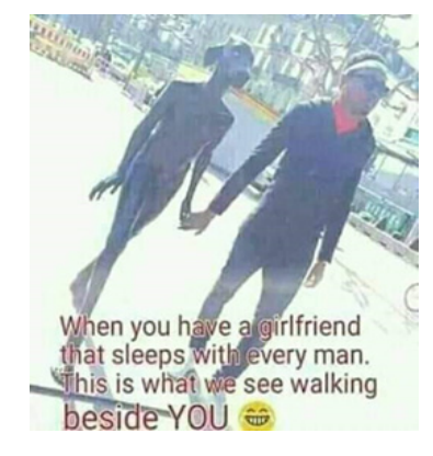
Meme 9 Meme 10 Meme 11

Meme 10 reads, 'I'm looking for an investor' This meme depicts a woman as a prostitute who wants to use her body for monetary gain. She is also portrayed as a gold digger or lover of money. The woman is half-naked. There seems to be interest on the nudity of women in the meme. From the social constructionist perspective, some Zambians may not appreciate this meme because a woman is expected to cover her nakedness. This kind of dressing shows a lack of respect and dignity for one's self.