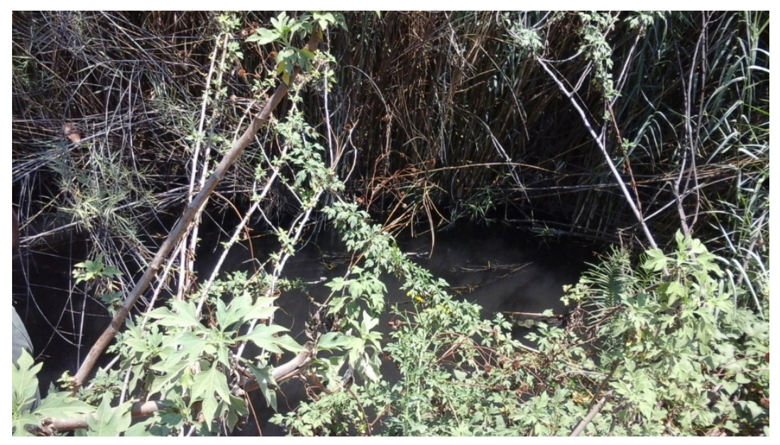
Figure 3: Raw sewage flowing at sampling point 2

Iron is one of the two most abundant minerals in the earth's crust which could account for the high concentrations at all the sampling points. Further, effluent such as raw sewage is known to contain traces of heavy metals and this may contribute to the high levels of the metal as raw sewage was found flowing at sampling points 1 and 2.