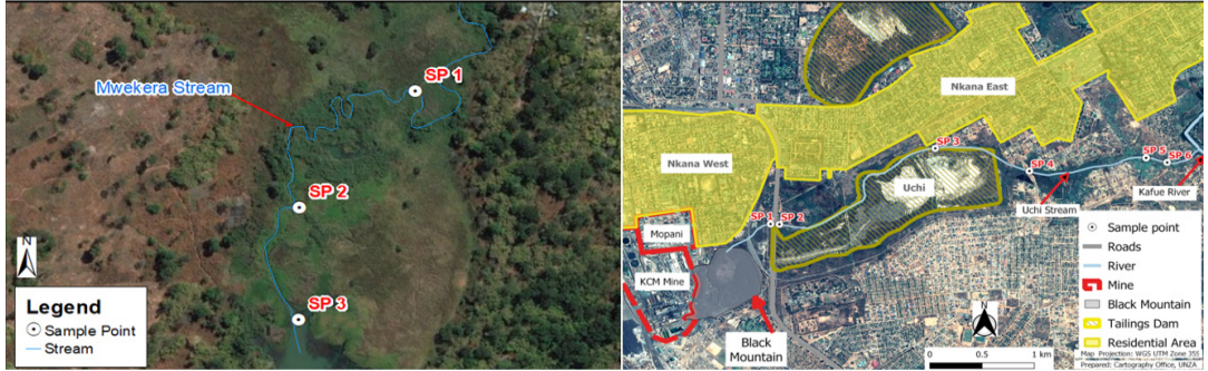
Figure 2: Sampling points along Mwekera and Uchi Streams

(Minitah Inc. 2017) at 5 per cent level of significance