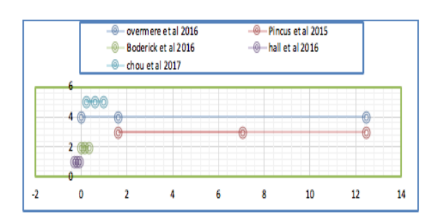
Figure 2: A forest tree diagram of CBT studies

The results of the review showed moderate evidence that CBT is more effective than an ordinary management in reducing long term disability in a population with chronic pain. Moderate evidence was found that CBT may be effective than traditionally-based physiotherapy in reducing post-treatment fear avoidance beliefs in chronic population but less effective than other behavioral interventions in reducing short term fear avoidance beliefs in a population. Moderate evidence suggests CBT is more effective than a placebo intervention in reducing short term pain in chronic pain. Findings that CBT may be more effective than usual care in reducing short term pain in chronic pain are not of clinical significance. The reviewed studies are illustrated in the forestry tree diagram in figure 2.